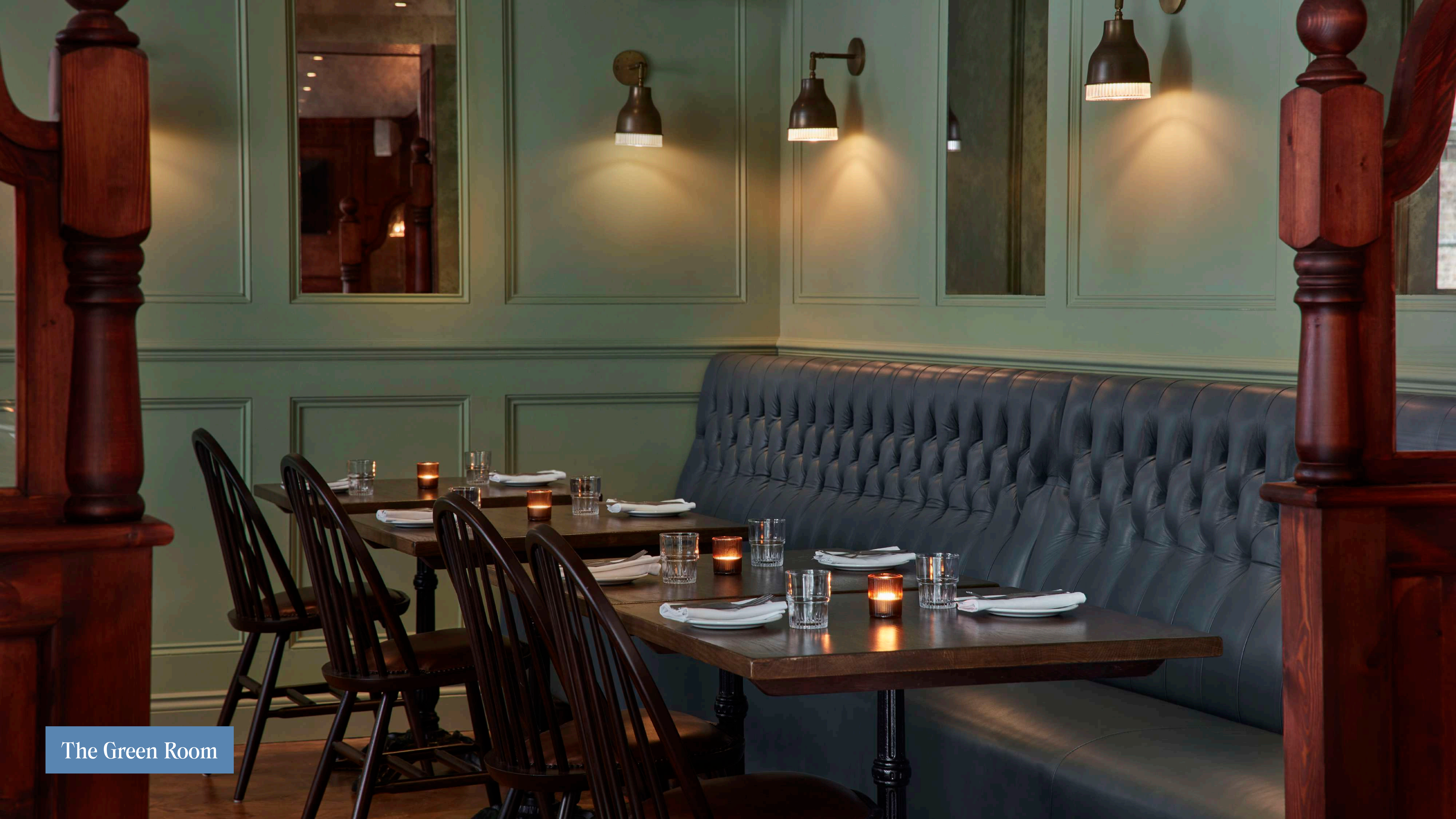
The Green Room