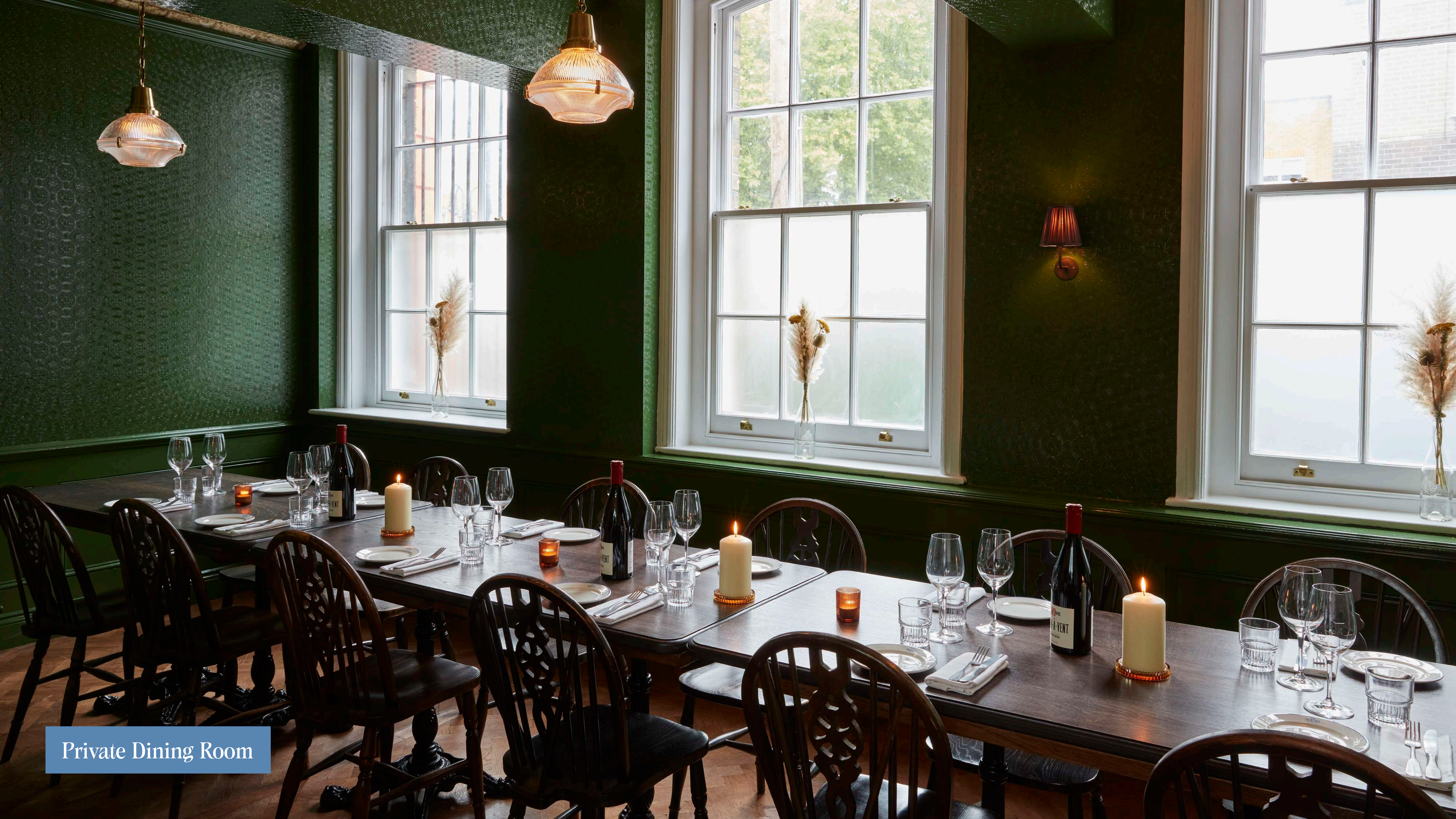
Private Dining Room