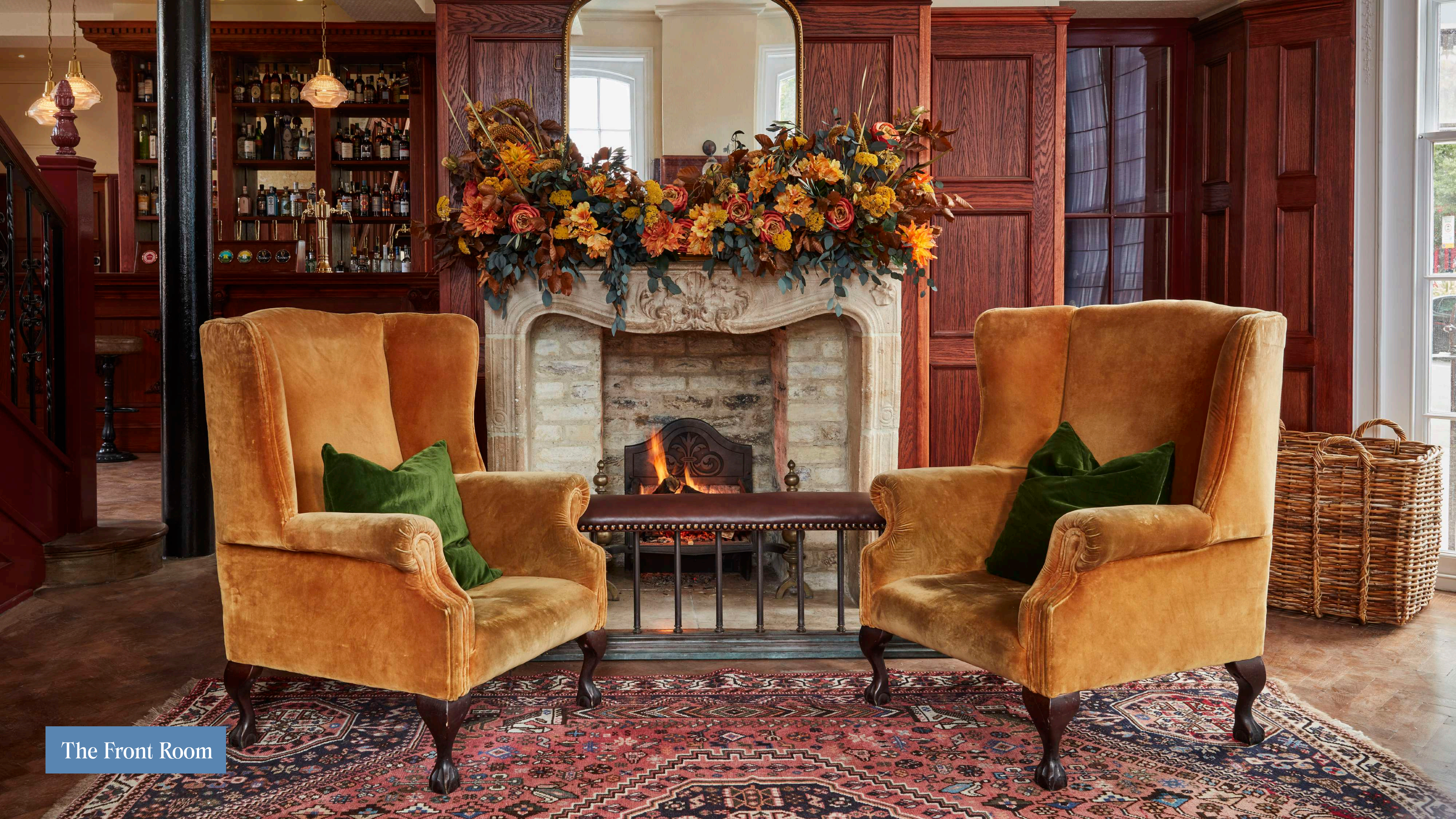
The Front Room