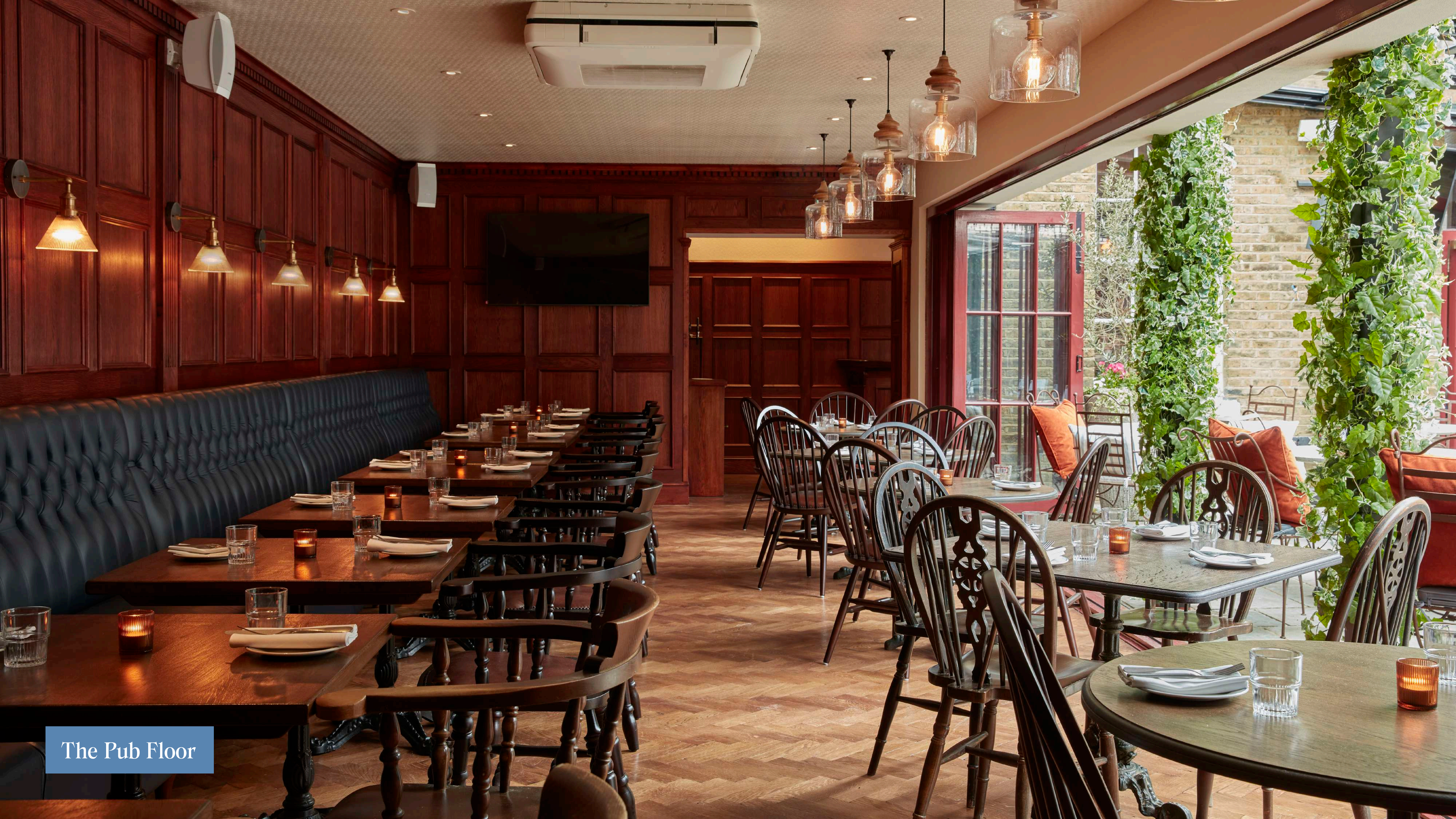
The Pub Floor